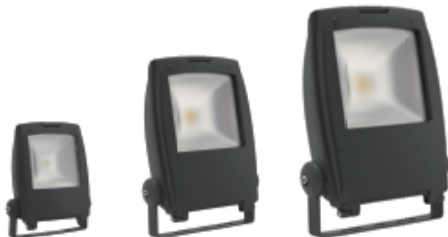
RINDO LED MCOB-10-GM