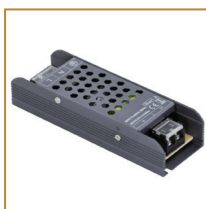
Zasilacz modułowy 100W Modular power supply 100W