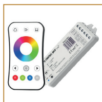
Zestaw SKY RGBW (pilot+sterownik) SKY RGBW Controller Set (remote+receiver)