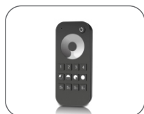
art.no: PD027224 Dimmer to single colour LED strips