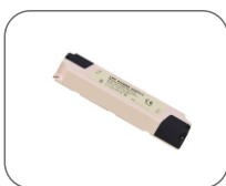
art.no: PB021581 PS-ME-60W12V5A 1581