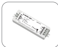
art.no: PD027279 Dimmer to single colour LED strips