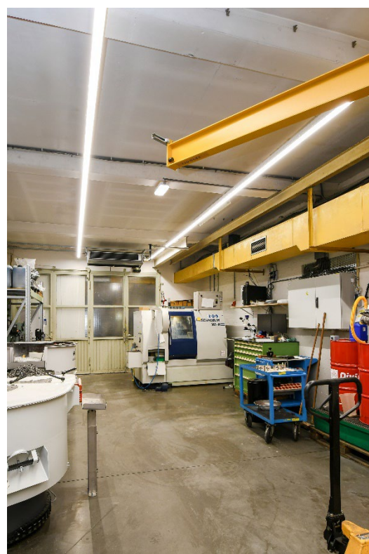
The TRUSYS FLEX system offers a bright and comfortable lighting for Machinefactory Klinkers.