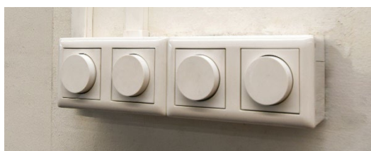
An MCU SELECT DALI-2 component has been installed to dim the trunking system